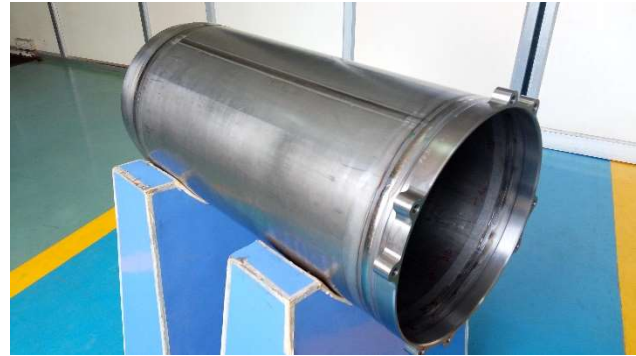
Akash Missile Module 2