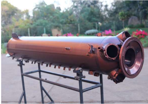
Akash Missile Module 1