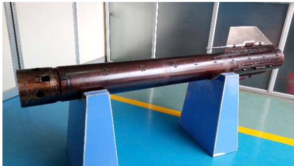
QRSAM Missile Module