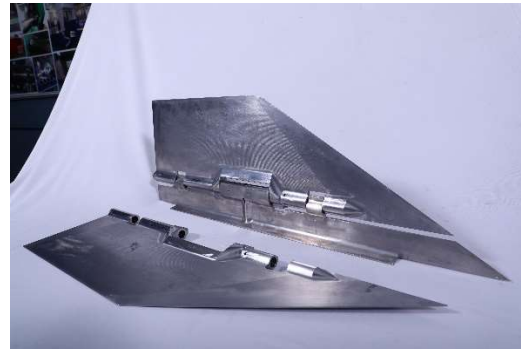
QRSAM Missile Wings