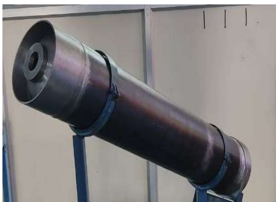
PSLV RRM Casing